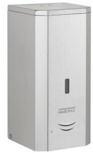
DJF0038ACS Satin finish