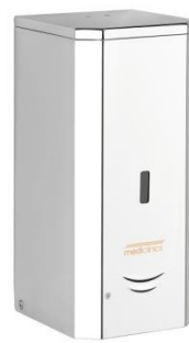
DJF0038AC Bright finish